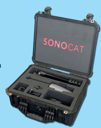
This photograph is for illustration purposes and may be subject to change